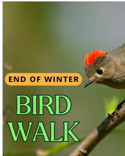
End of Winter Bird Walk

Click here to explore our full calendar of events!