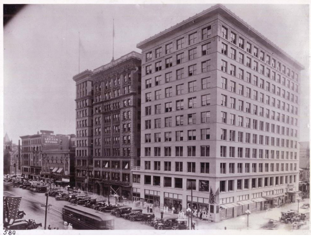
Above: Reibold building ca 1930s, located at the corner of West 4 th & Main St., Dayton Ohio.

that afternoon, but found little else in the way of clues. What had happened inside Lucien Soward's office that day?