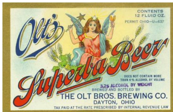
Above: an Olt Brewing Co. beer delivery truck Below: Olt's Superba Beer packaging