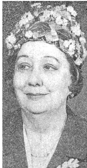
Marjorie Irene Heyduck

In 1964, Erma was writing for the local Kettering Oakwood Times with weekly columns which yielded $3 each. In 1965, the Dayton Journal Herald requested new humorous columns and Bombeck agreed to write two weekly 450-word columns for $50. By 1969, 500 U.S. newspapers