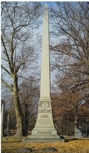
The Collins Obelisk

The stone was destined for Woodland Cemetery, where the above firm are erecting a monument for R.C. Schenck, and this stone was to be the base. It was on a stoutly built wagon, weighing one ton, and ten horses were required to draw the wagon. After being refused permission to cross the bridge referred to, the workmen attempted to cross the Fifth street bridge, and were again met