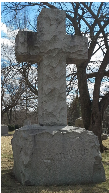
The Schenck Monument

From 1893 to 1896, many large monuments were placed at Woodland. Some came in easy while others created challenges for the movers.