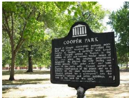
Cooper Park Historical Marker