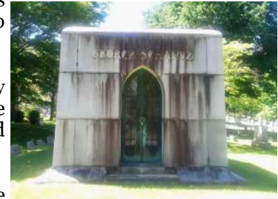
Schantz Mausoleum Before and After